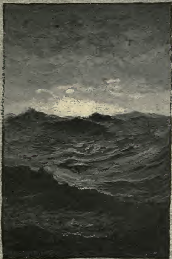
"MOONRISE AT SEA." Page 200.